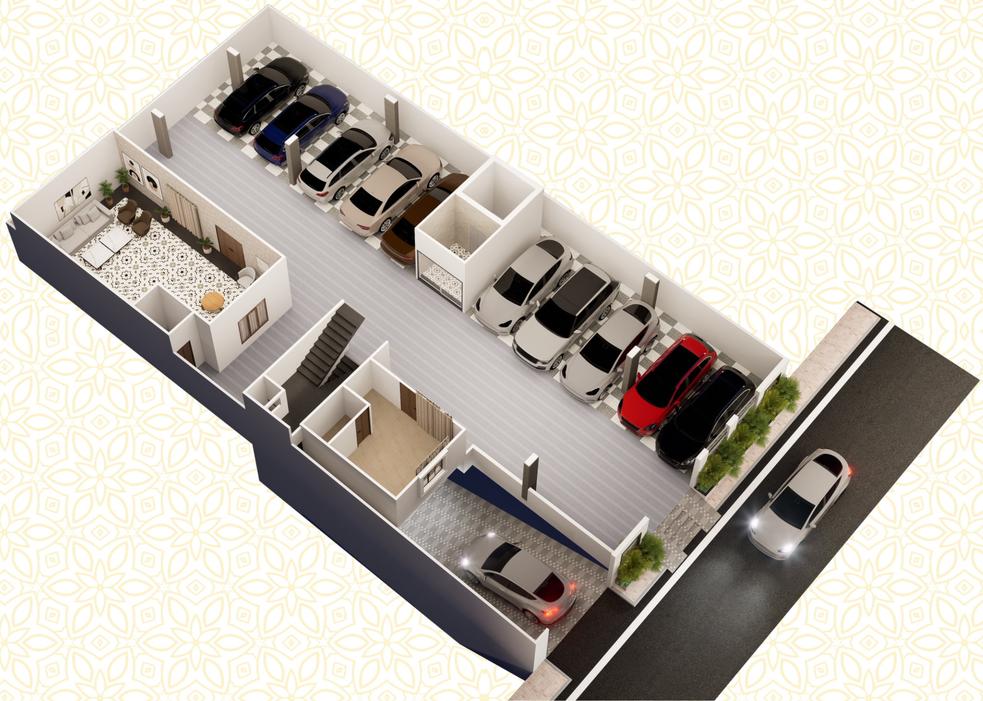
Parking Plan Sky View Residency - II