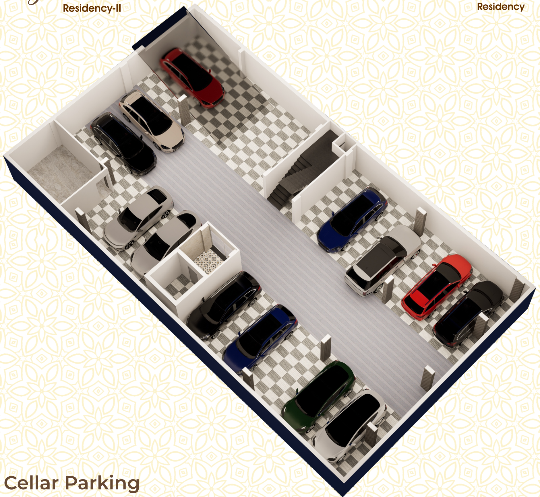
Cellar Parking Sky View Residency - II